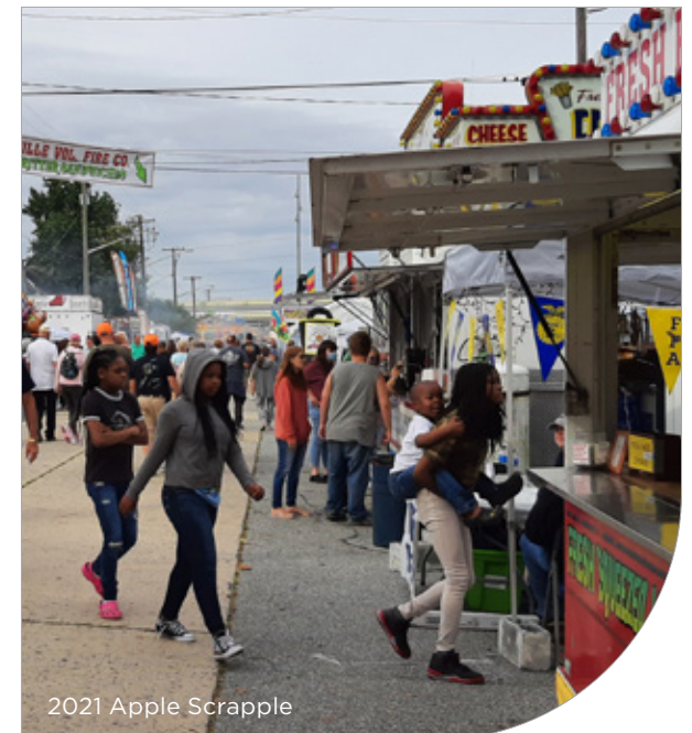
2021 Apple Scapple