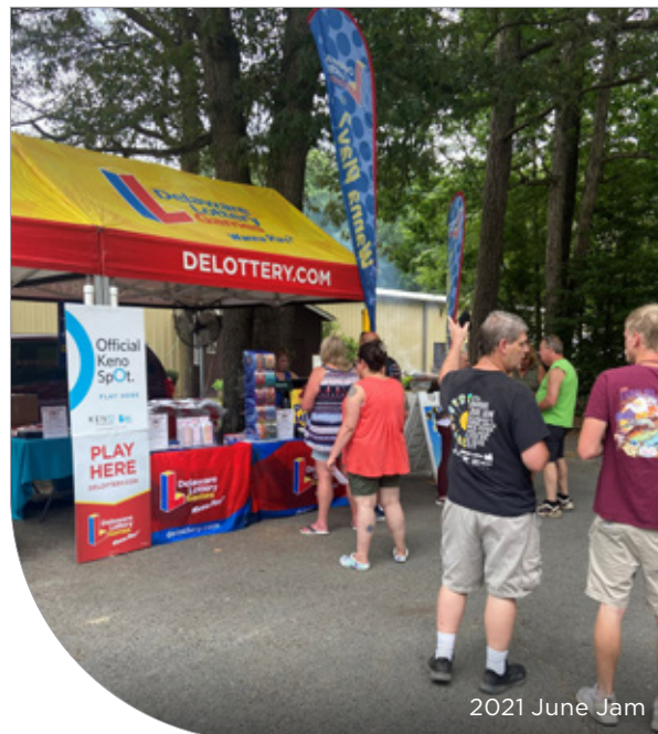
2021 June Jam