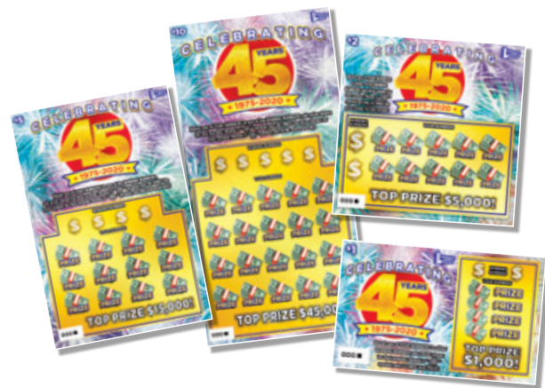
45th Anniversary Family of Games