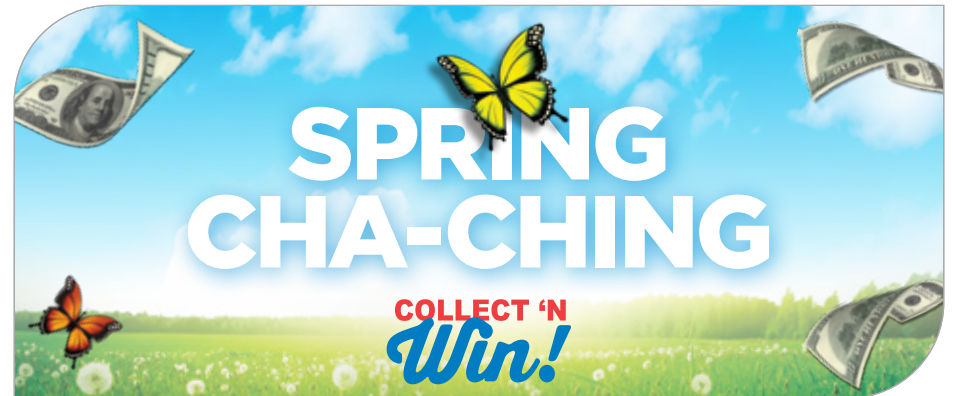
Trailer Ticket promotion

The holiday period is a good time to raise public awareness about the risk of underage lottery play during this gift-giving season. This year, the Delaware Lottery took part in the Holiday Lottery Responsible Gambling Campaign , an initiative brought by the National Council on Problem Gambling , the International Centre for Youth Gambling Problems and High-Risk Behaviors at McGill University, and the North American Association of State and Provincial Lotteries (NASPL) , to join partnerships with lotteries across the U.S. to create a holiday campaign designed to educate communities about the risk of buying lottery tickets for children during the holidays. Campaign participants were provided with materials and messaging (or created their own) to communicate responsible gambling during the holiday season. We will continue to promote responsible gambling throughout the year.