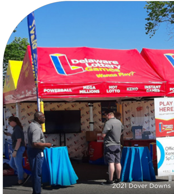
2021 Dover Downs