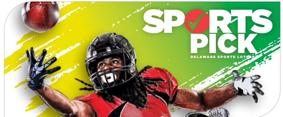
Sports Pick Football Wagering promotion