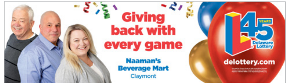
45th Anniversary Retailer Spring Campaign outdoor billboards