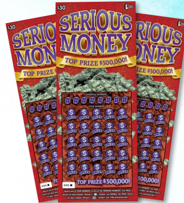
Serious Money Instant Game

Sales for Instant Games in fiscal year 2022 reached $110.8 million .