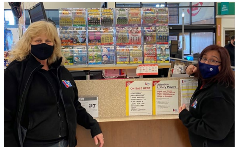
Keep 'Em Full mystery Instant Game promotion