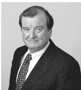
John C. Carney, Jr. Secretary of Finance

The 1998 numbers are in, and once again the Delaware Lottery is a big winner for all Delawareans.