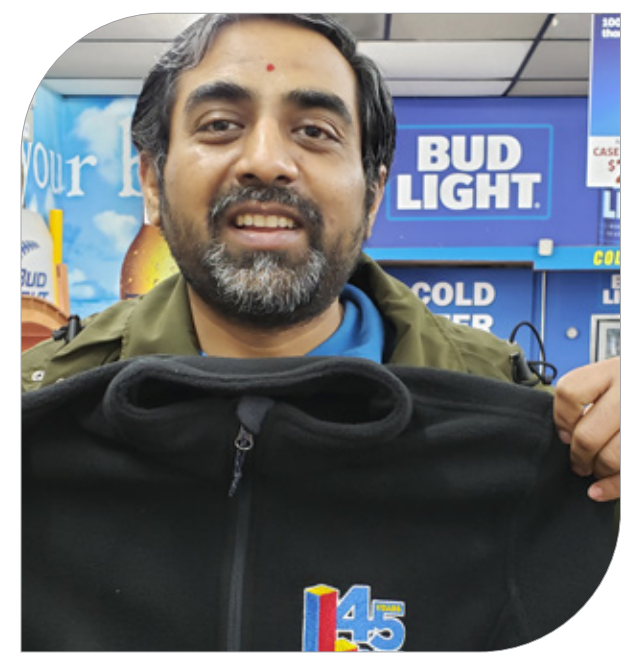
Shown above: Winners from the Keep 'Em Full Mystery Instant Game promotion