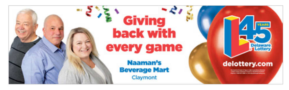
45th Anniversary Retailer Spring Campaign outdoor billboards