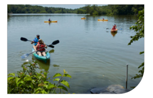
Lums and Killen Pond State Parks Retailer events