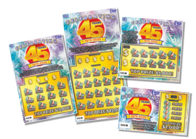
45th Anniversary Family of Games

Fiscal Year 2021 also saw Instant Game sales reach a record high of $111.2 million.