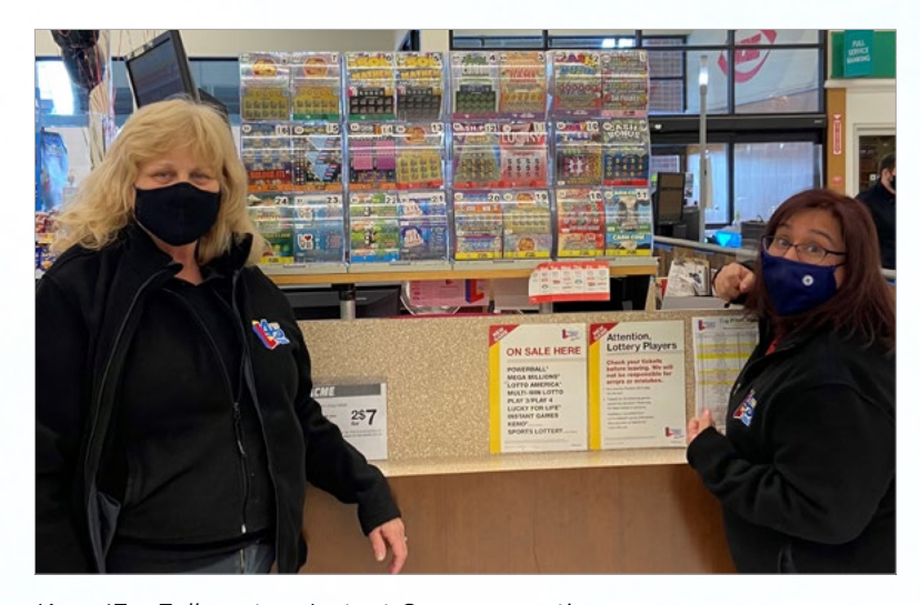
Keep 'Em Full mystery Instant Game promotion