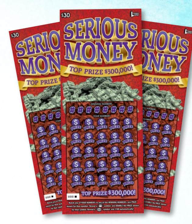
Serious Money Instant Game

Sales for Instant Games in fiscal year 2022 reached $110.8 million.