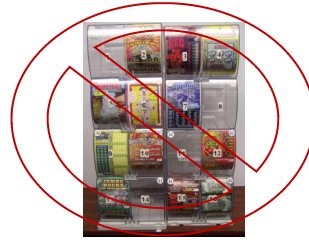
Dispenser with EMPTY BINS