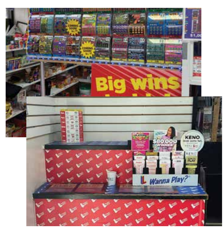
Orange Deli & Grocery - Wilmington