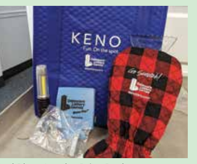
2nd Place Leader Prize Pack