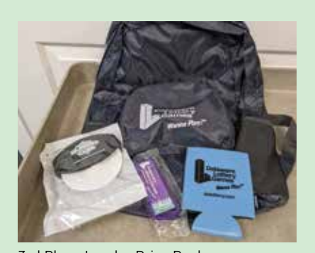
3rd Place Leader Prize Pack