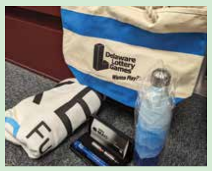
Leader Prize Pack