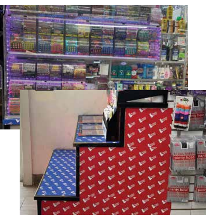
Orange Deli & Grocery - Wilmington